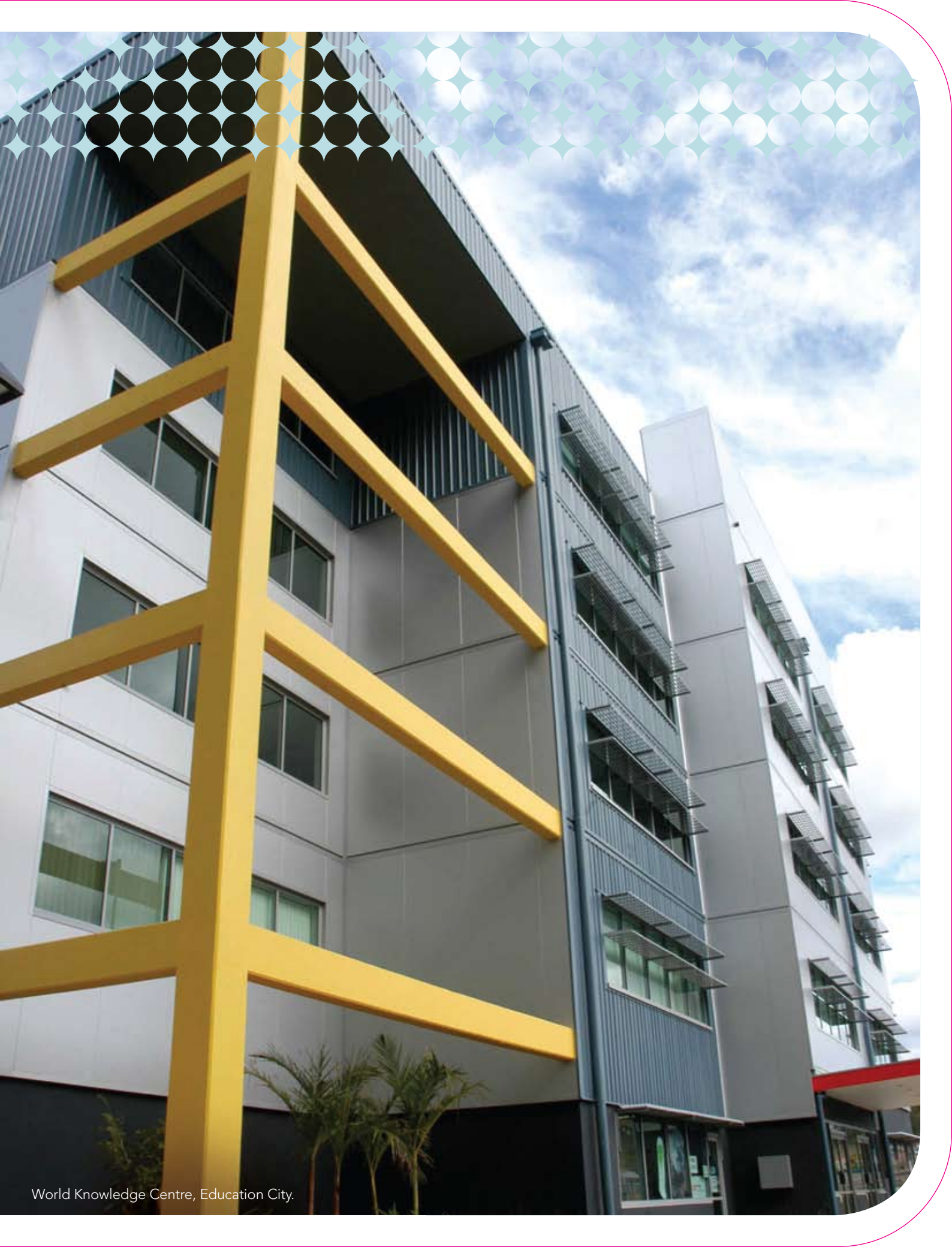
World Knowledge Centre, Education City.